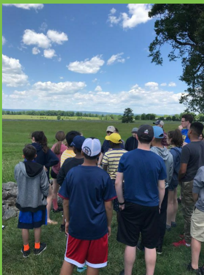
Grade 7 and 8 took a guided tour of the Gettysburg Battlefield.