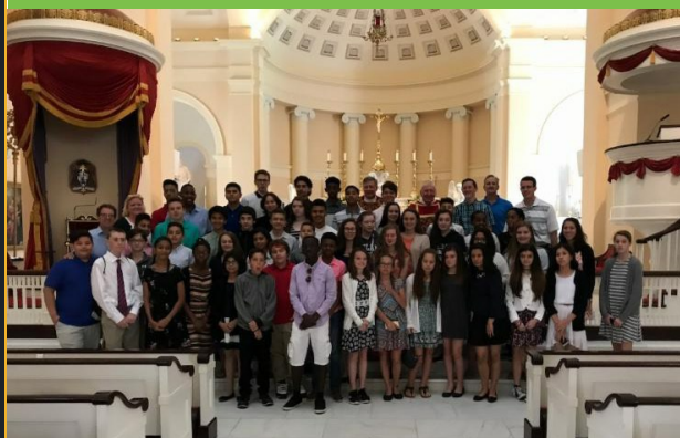
Grade 7 and 8 attended mass at the Basilica in Baltimore.