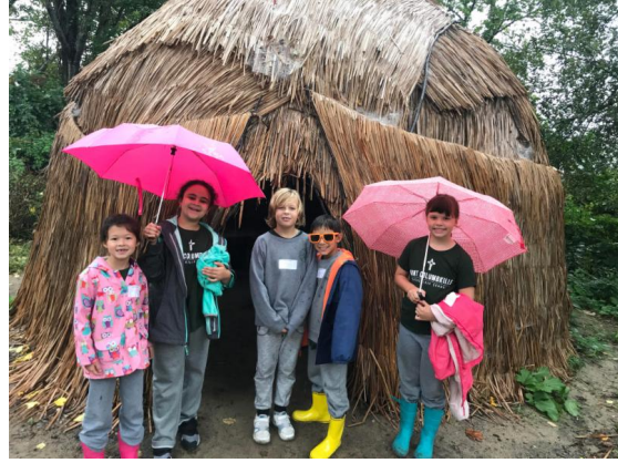
Grade 3 enjoyed their field trip to Plymouth Plantation even in the rain!

Click here to register your grandparent or special elder!