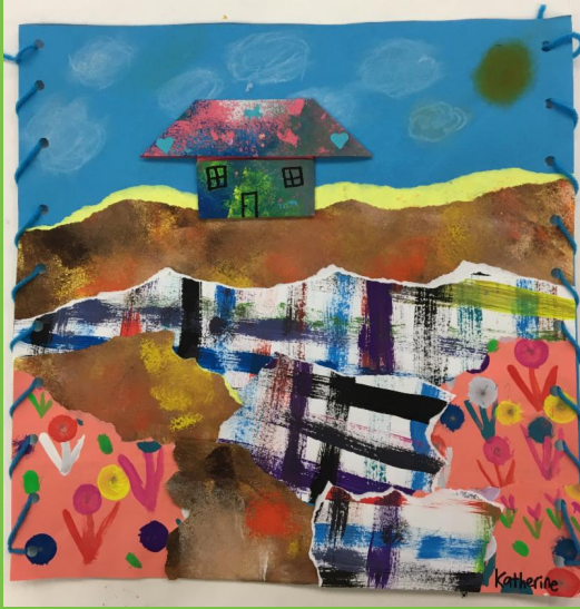
7th grade mixed media Chilean Arpilleras.

Click here to register your child for the basketball program.