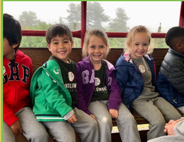
K2 students enjoyed apple picking during their field trip to Tougas Farm.