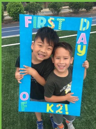
K2 students on the first day!

On Friday we raised over $1,900 for St. Catherine of Siena School in Texas. Loyola Academy students also made cards that we will be sending to the students.